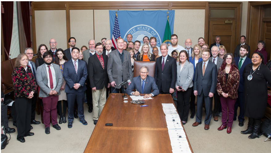
E2SHB 1783 (Legal financial obligations) Bill Signing

Upon an indigency finding, courts must grant permission for LFO payments to be made in installments. Courts are prohibited from sanctioning a defendant for failure to pay LFOs unless the failure to pay was willful, which can only occur if the defendant has an ability to pay. Failure to pay LFOs is not willful if the defendant is homeless or mentally ill.