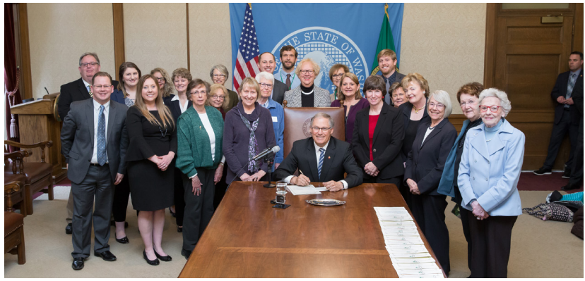
2SHB 1896 (Civics education) Bill Signing

Probation officers no longer need to review dependency petitions when the Department of Social and Health Services files the dependency petition.