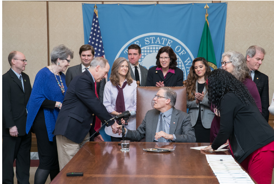
SHB 2308 (Civil legal aid) Bill Signing

Establishes legislative findings that civil legal problems experienced by low-income people in the state exceed the state-funded civil legal aid system's capacity to address. Directs the